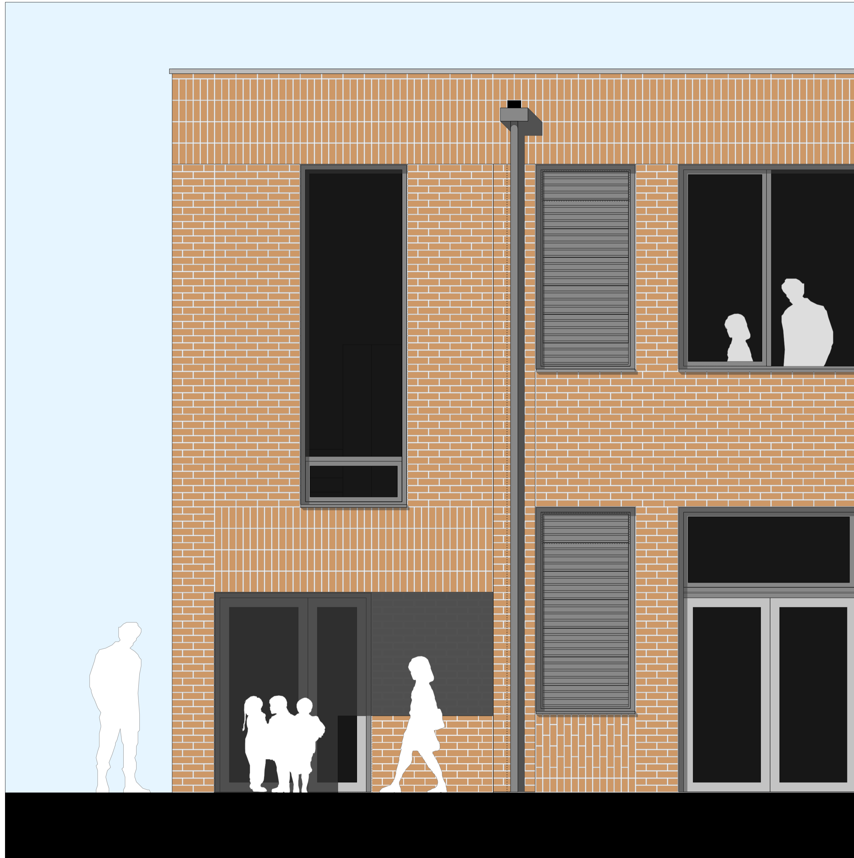
PART ELEVATION: REAR STAIR/ENTRANCE